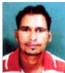
Vinil 39 years from Uttarakhand ₹3,00,000/-