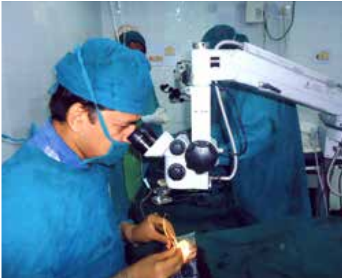
A surgeon conducting a cataract surgery operation