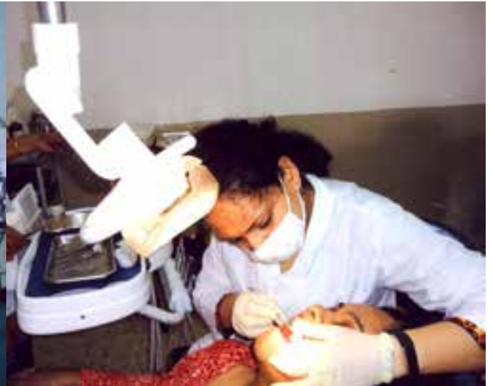
A dentist providing free treatment to a patient

Saviours Foundation to benefit the inmates of an old age home and rescue centre run by them. The Company has attended to the accommodation, medical and everyday needs of abandoned senior citizens, deprived mentally-disabled individuals, bed-ridden, HIV-infected patients and patients suffering with incurable diseases, among others, free of charge. The Company provides