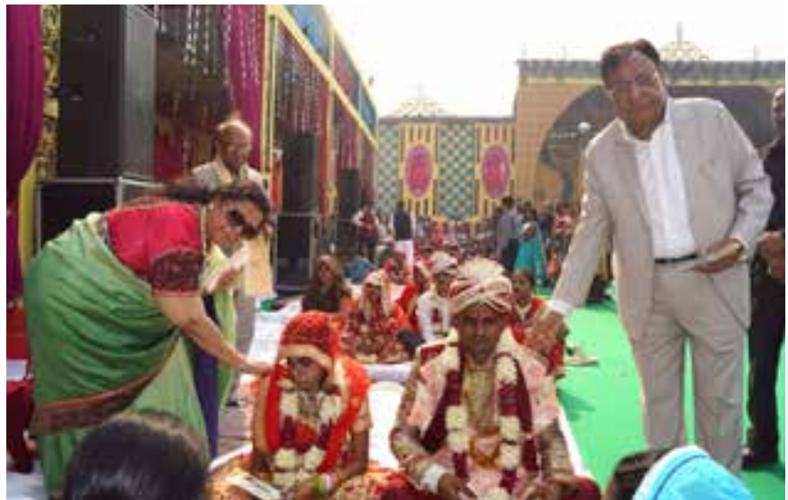
Extending financial support for the marriage of less-privileged girls.

The Company is engaged in various social welfare programmes like arranging mass marriages for poor girls, free eye operations and other activities for the underprivileged.