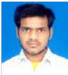
Upender 18 years from U.P. ₹1,00,000/-