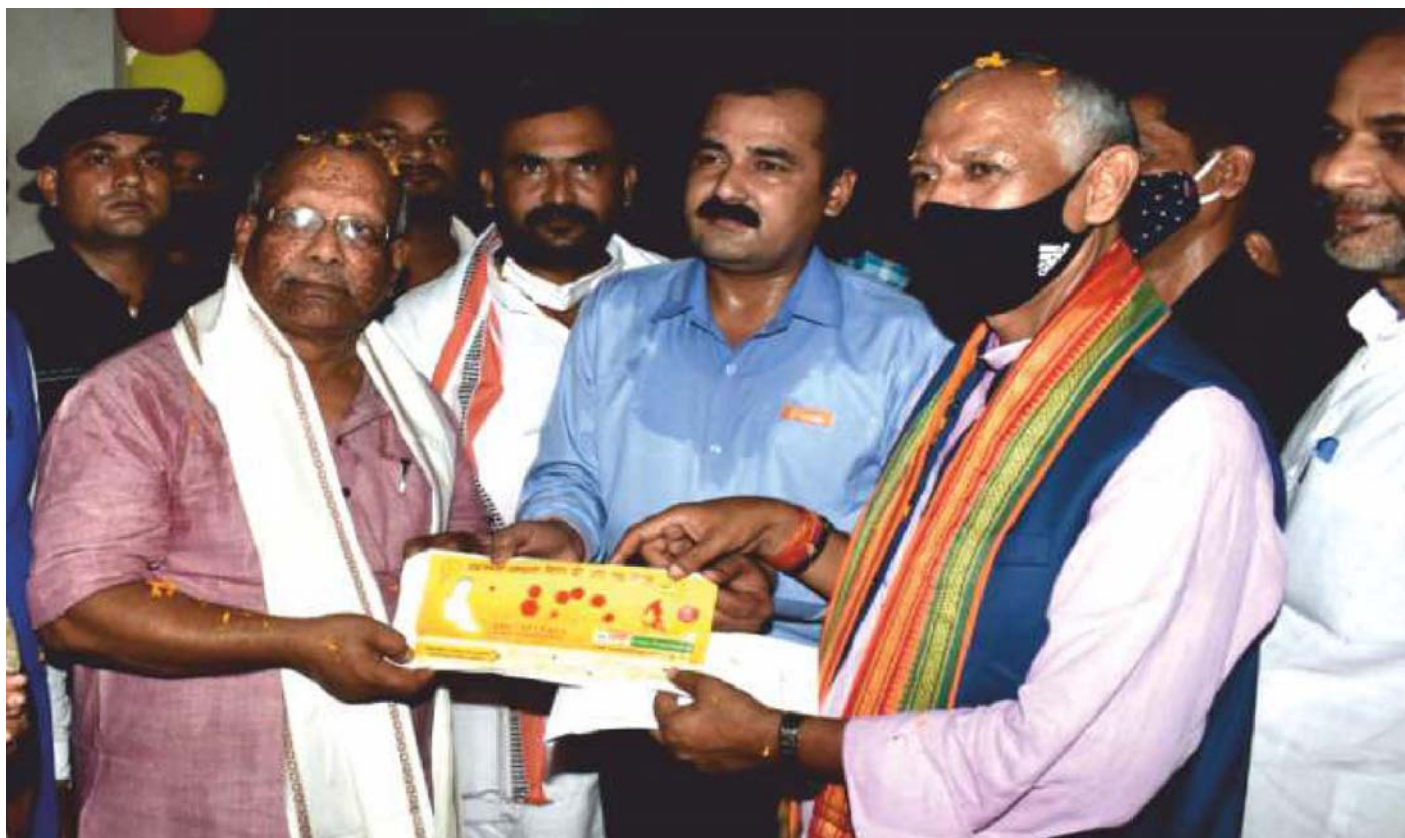
Sh. Tarkishor Prasad, Deputy CM, Bihar and Sh. Janardan Singh Sigrwal, MP from Bihar inaugurated the Pad Making Machine.

Stepping forward towards its cause of women empowerment and in solidarity with Prime Minister's Swachh Bharat Mission, Fiem Foundation set-up Sanitary Pad Making Machine in Jalalpur, District Saran, Bihar for free distribution of Sanitary Pad to poor women and girls towards creating awareness among them about importance of menstrual hygiene.