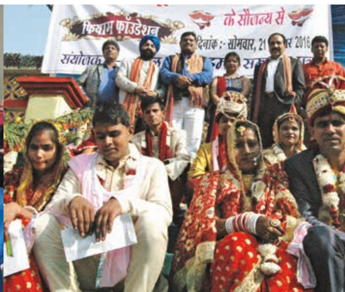
Extending financial support for marriages of poor girls.