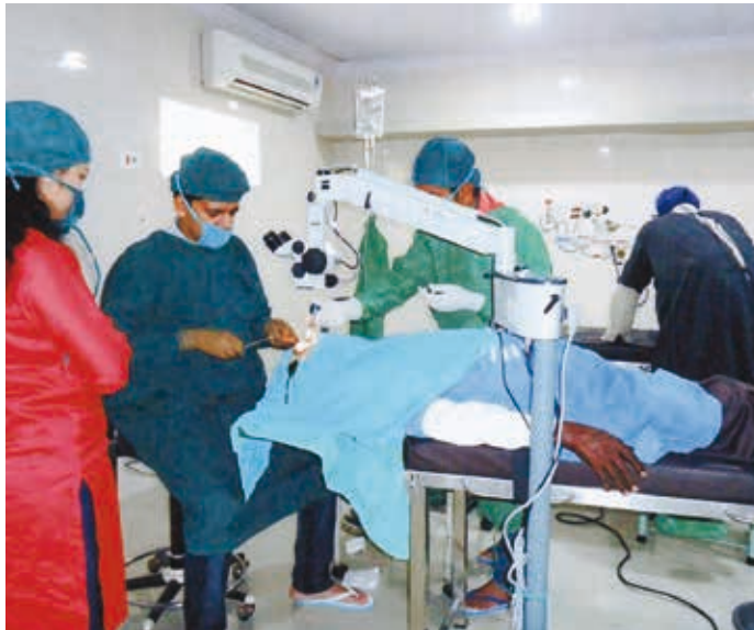
Extending financial support for Eye operations camps.