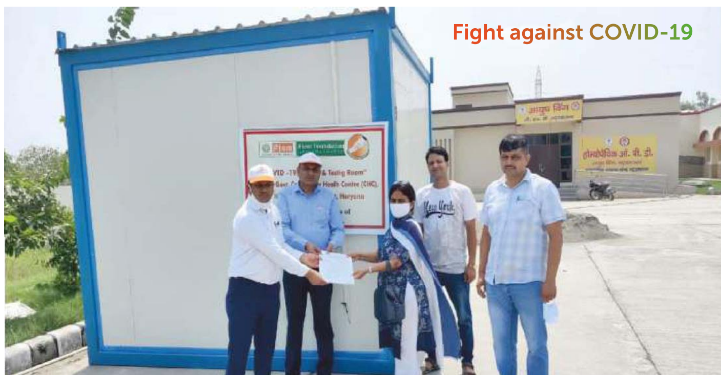
COVID-19 Sample & Testing Room provided for urgent need at Govt. CHC, Badhkhalsa, Distt. Sonipat, Haryana