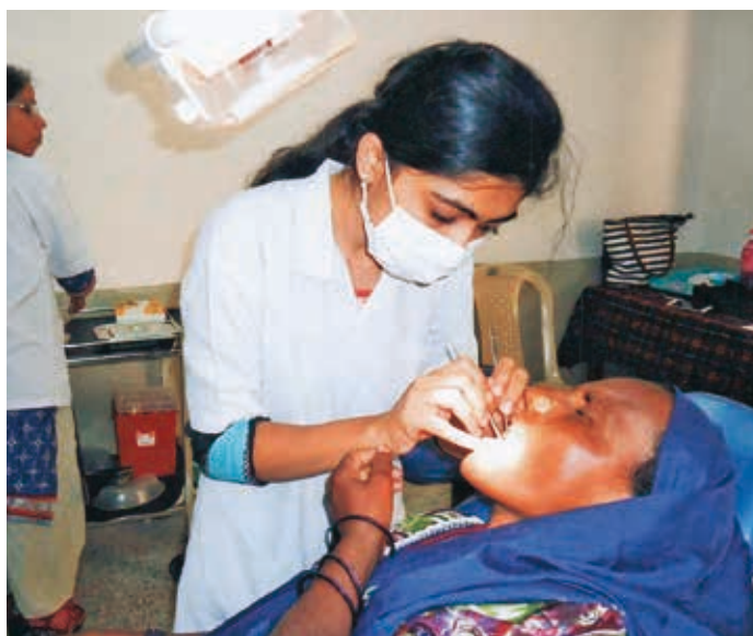
Extending financial support for Dental care camps.

We have formed the 'Fiem Foundation', which supports the CSR provisions whole heartedly as per Schedule VII, the Companies (Corporate Social Responsibility Policy) Rules, 2014.