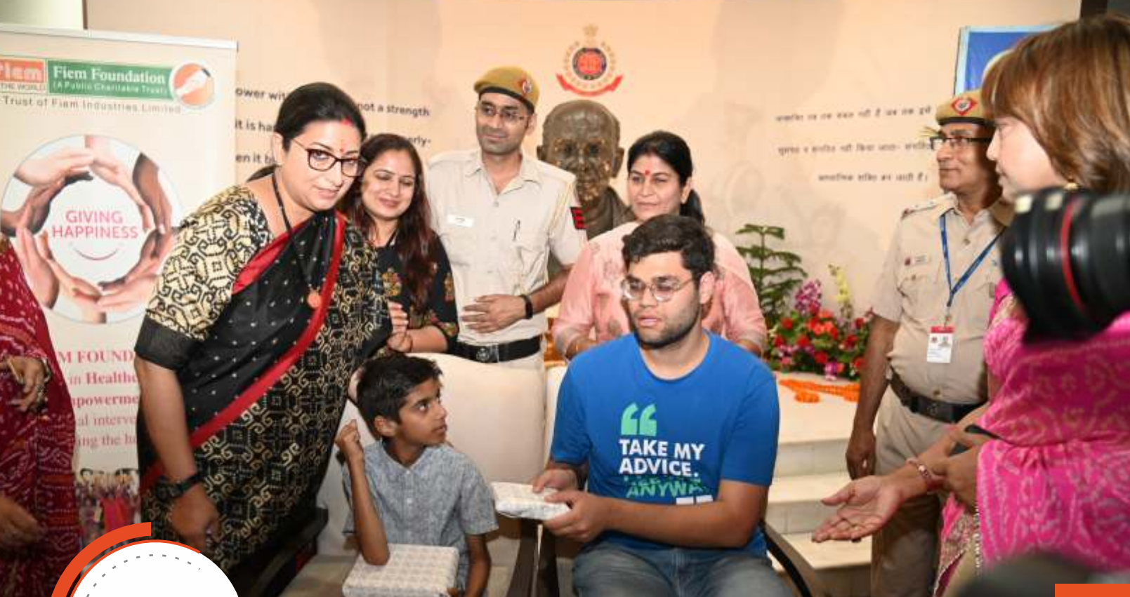
Distribution of Hearing aid to Specially abled