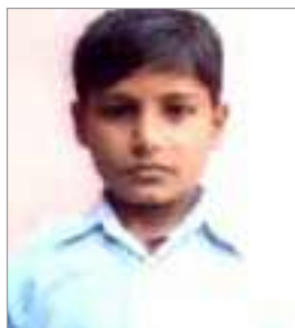
Moin 8 years from U.P. ₹1,00,000/-