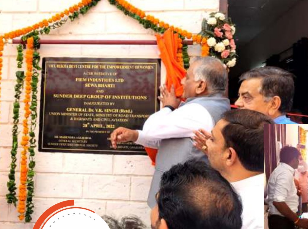
Inauguration of Sanitary Pad Unit in Ghaziabad