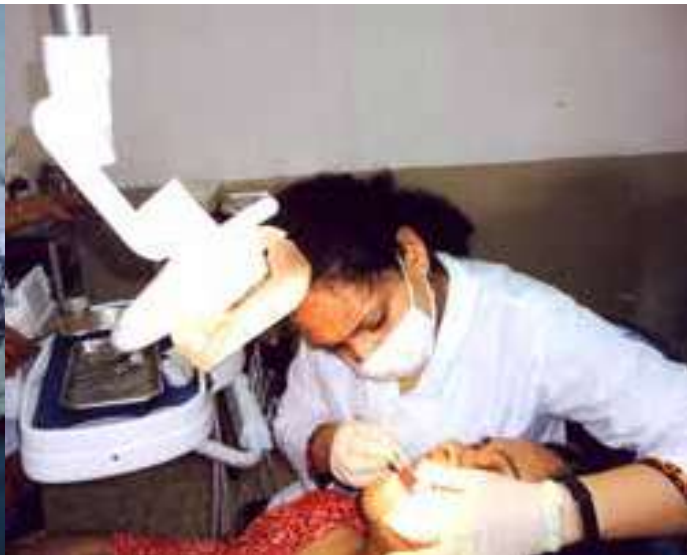
A dentist providing free treatment to a patient

Saviours Foundation to benefit the inmates of an old age home and rescue centre run by them. The Company has attended to the accommodation, medical and everyday needs of abandoned senior citizens, deprived mentally-disabled individuals, bed-ridden, HIV-infected patients and patients suffering with incurable diseases, among others, free of charge. The Company provides