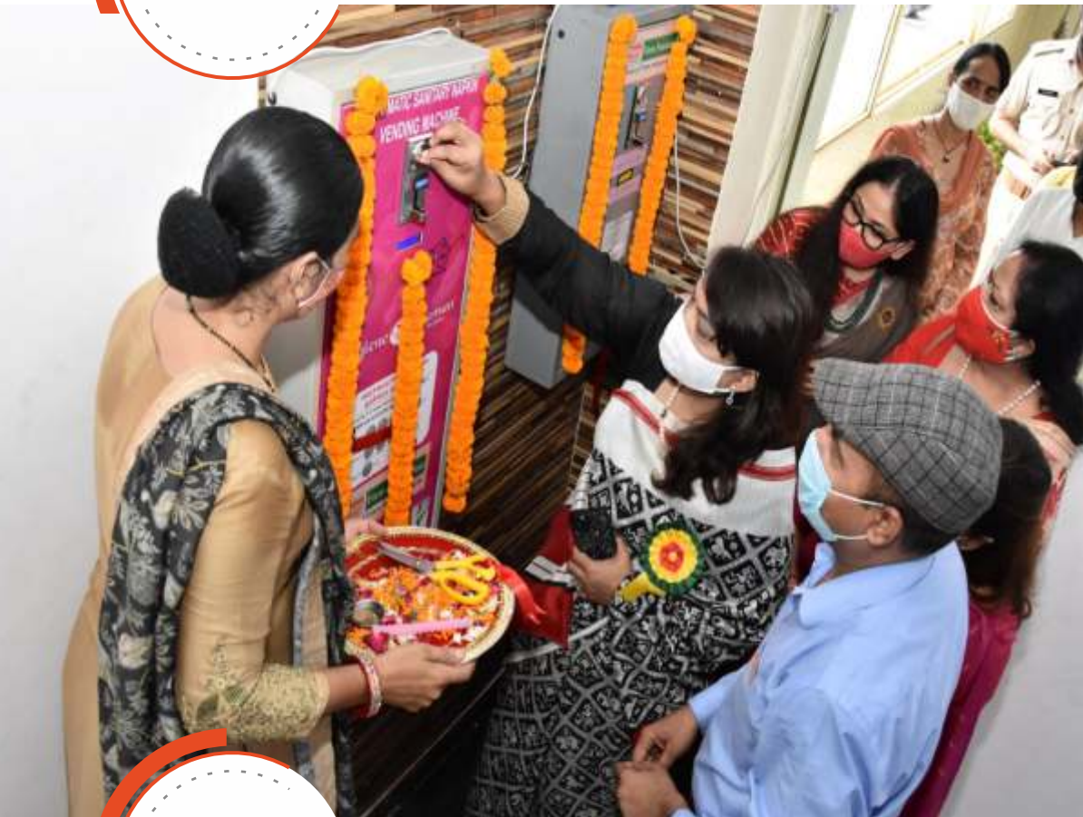
Inauguration of Sanitary Pad Vending Machine