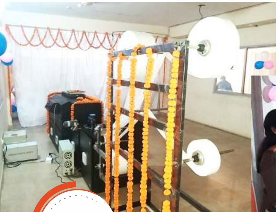
Inauguration of Sanitary Pad Unit in Lucknow