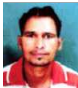
Vinil 39 years from Uttarakhand ₹3,00,000/-