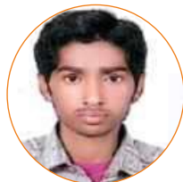
Harvender 30 years from U.P. ₹ 2,50,000/-