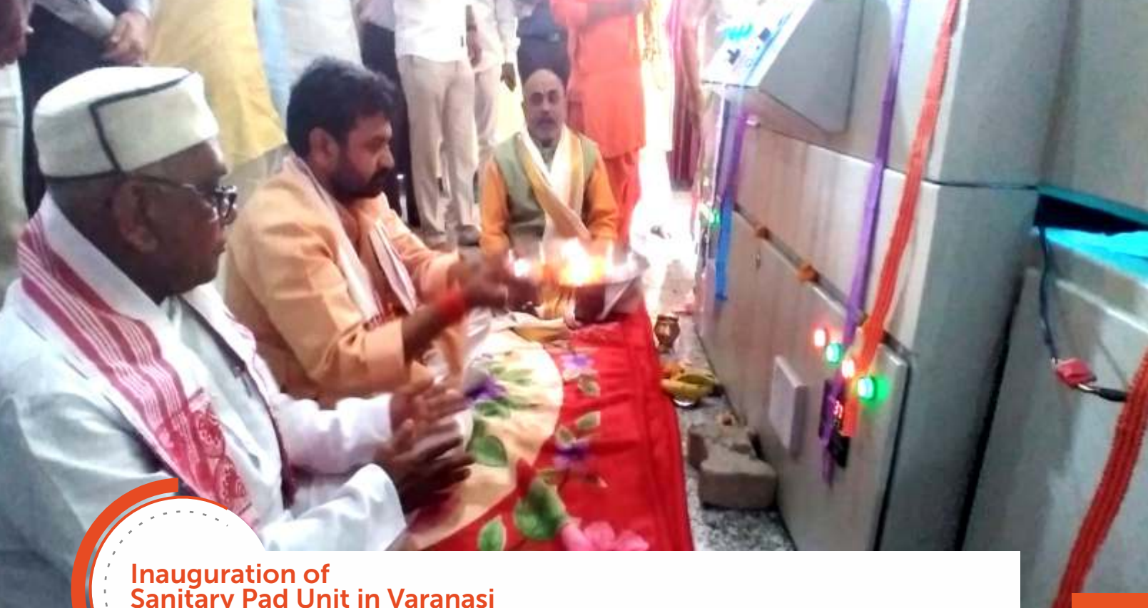
Inauguration of Sanitary Pad Unit in Varanasi