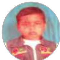
Kismat 7 years from Bihar ₹ 1,00,000/-