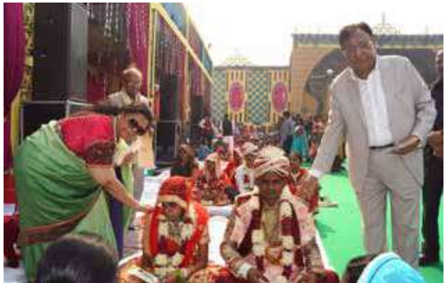
Extending financial support for the marriage of less-privileged girls.

The Company is engaged in various social welfare programmes like arranging mass marriages for poor girls, free eye operations and other activities for the underprivileged.