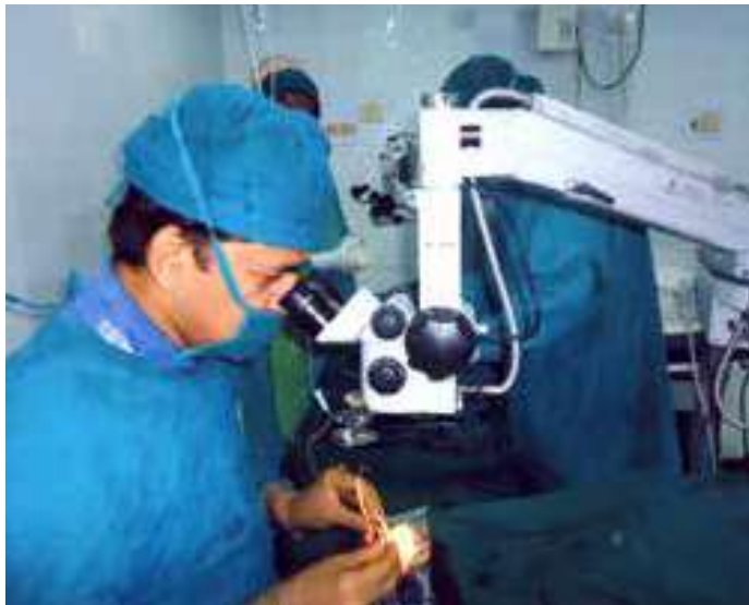
A surgeon conducting a cataract surgery operation